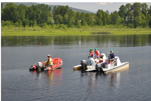
All the boat operator volunteers in action