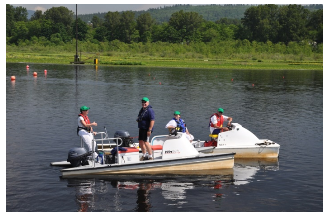
the referee boats